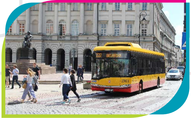
Solaris Urbino 12 electric in service

MZA purchased 10 Solaris Urbino U12 e-buses as the first phase in electrifying city centre transport. Currently, the buses operate on line 222, which passes through the congested centre as well as the historic part of the city. The entire line is operated solely with e-buses. Passengers appreciate the comfort and driving dynamics, despite the fact it can sometimes be crowded (for obvious reasons). An efficient HVAC system completes the positive overall opinion of the vehicle.