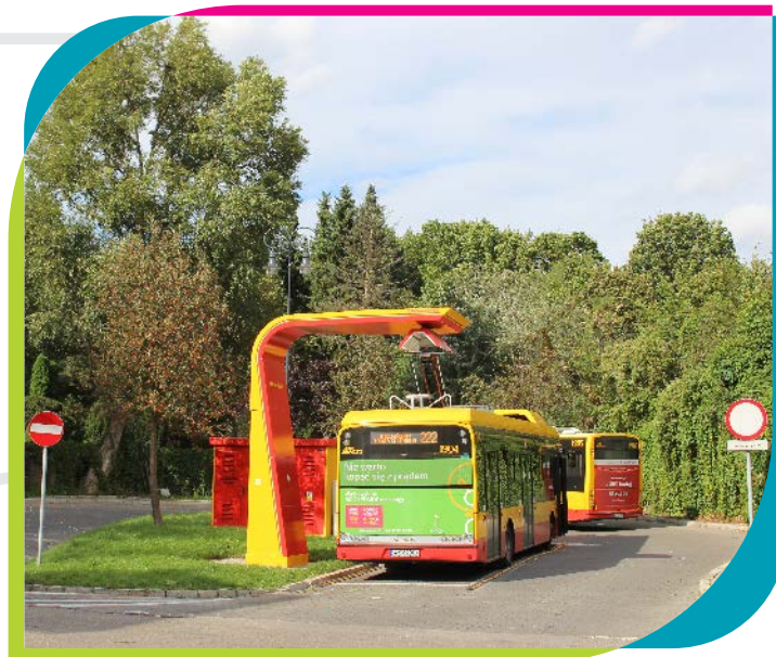
Opportunity charging at the end of the line

The MZA Warszawa has an impact on the environment through diesel fuel savings and reducing CO2 emissions, GHG emissions, SO2 emissions as well as other pollutants. Noise pollution is also reduced.