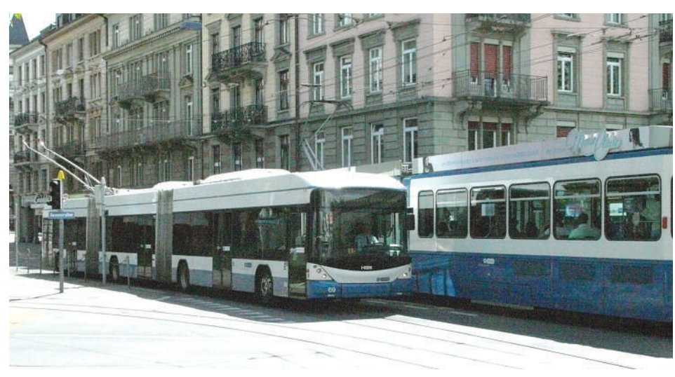
Electric transport in Zurich, but look at all the wires overhead.