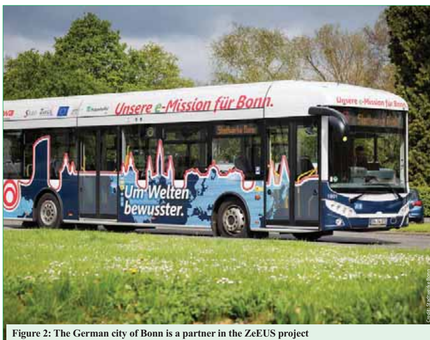
Figure 2: The German city of Bonn is a partner in the ZeEUS project

Fortunately progress is already being made on this front; a joint effort of ZeEUS, VDV and UITP has already delivered material to CEN/CENELEC – the European body for standardisation – which will be the base for developing the new standard. However, as this is unlikely to be ready before 2019, a group of manufacturers and technology providers are working on developing an industrial standard that can be used in the interim. The industry wants to have something sooner because