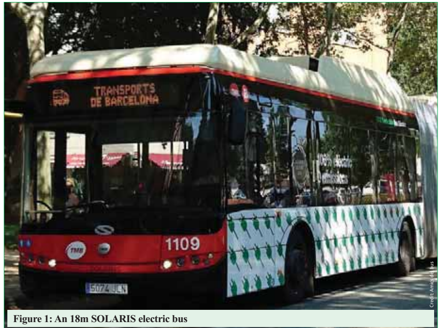
Figure 1: An 18m SOLARIS electric bus

ZeEUS is one of the largest electro-mobility projects ever funded by the European Commission and gathers 40 partners representing the entire value chain of standard electric buses: cities, operators, industries, researchers and energy providers. In order to extend the fully electric solution to a wider part of European urban bus networks, ZeEUS tests innovative electric bus technologies with different charging infrastructure solutions in 10 demonstration sites across Europe: Barcelona (ES); Bonn (DE); Cagliari (IT); London (UK); Munster (DE); Paris (FR); Plzen (CZ); Randstad (NL); Stockholm (SE); and Warsaw (PL). With nine demonstrations launched, the project has entered the evaluation phase. Principally the project will assess the feasibility of introducing high capacity electric buses from different aspects: economic, operational, social and environ-