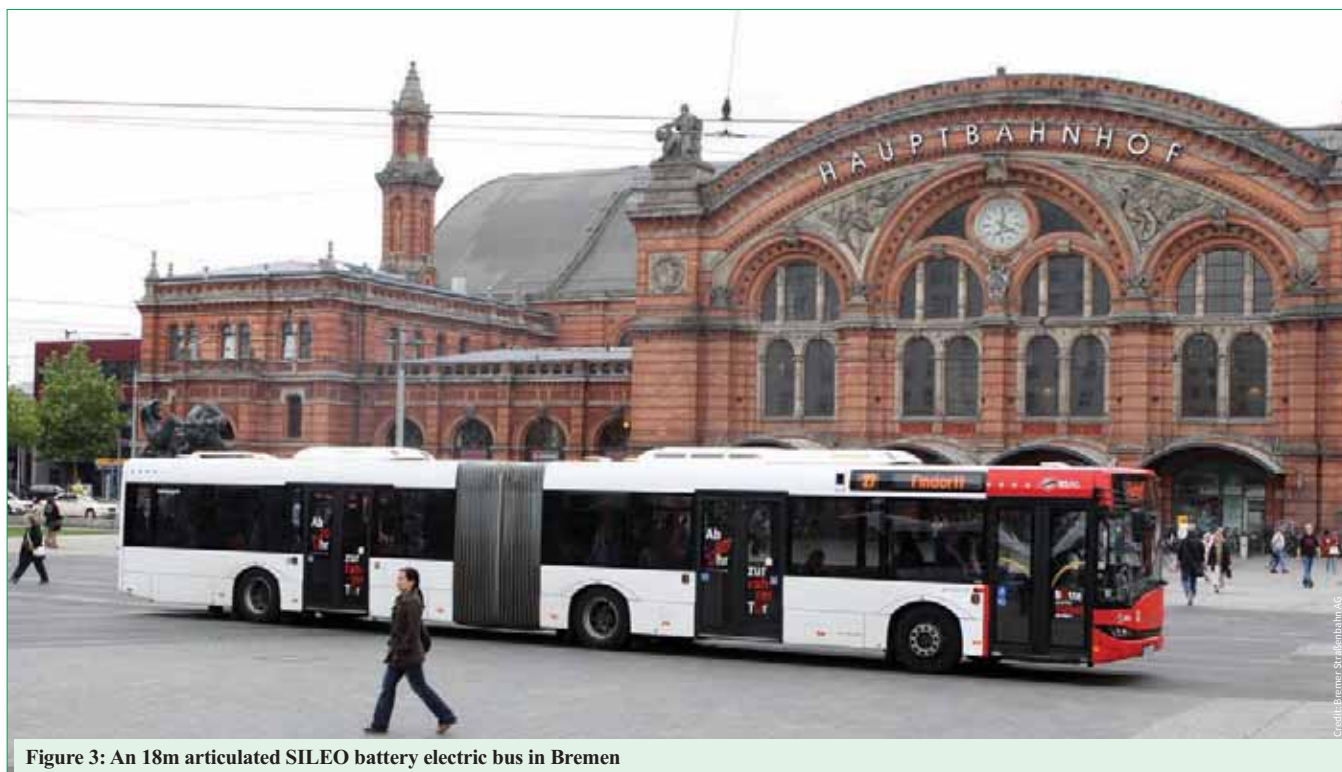
Figure 3: An 18m articulated SILEO battery electric bus in Bremen

the market is growing now and users don't want to wait until 2019 to start deciding.