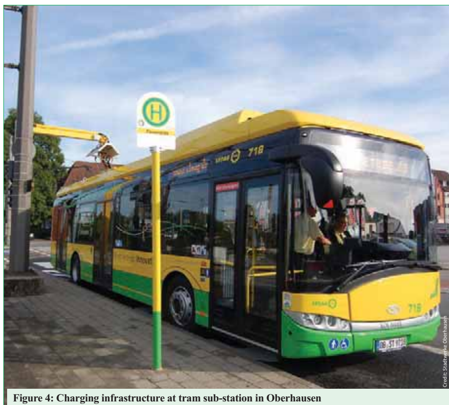
Figure 4: Charging infrastructure at tram sub-station in Oberhausen

ELIPTIC has 20 cases of technical applications, or feasibility studies, within 11 cities (Barcelona, Bremen, Brussels, Eberswalde,