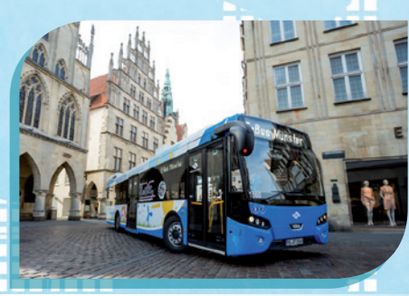
VDL Citea Electric