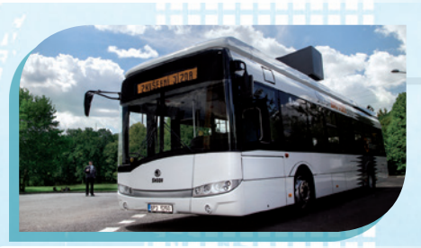
SKODA Perun Battery Electric Bus