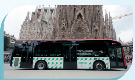
• IRIZAR i2e