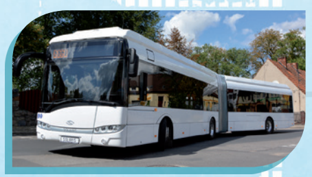
SOLARIS Urbino 18 electric