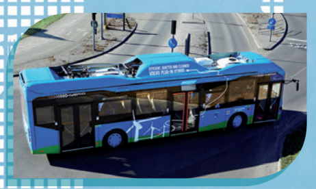
VOLVO 7900 Plug-in Hybrid Bus