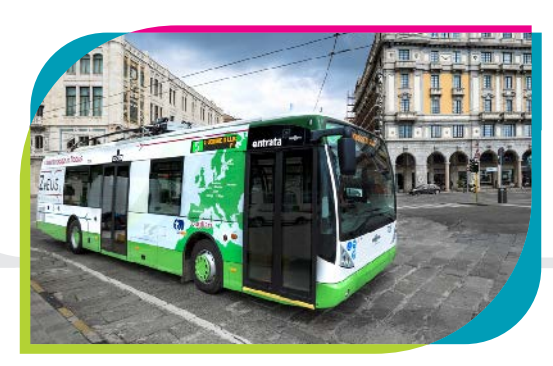
Kiepe Van Hool A330T while running the Line 5-ZeEUS by batteries