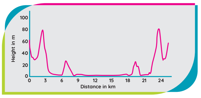
Elevation map of the line route - summer configuration