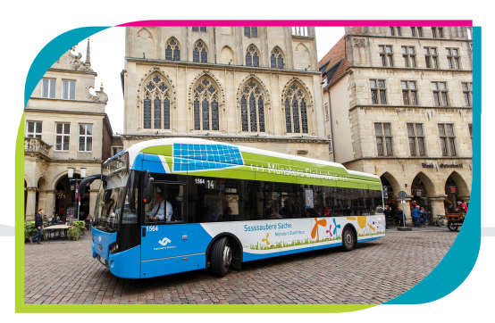
The electric buses pass through Münster's historic city centre

Av. no. of passengers/day: 5,000 passengers SORT type: 2