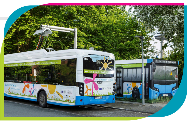
Charging by pantograph. The substation imitates an electric bus